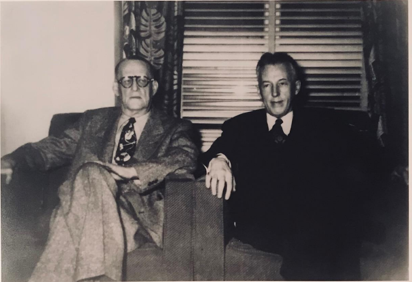
Dr. Bob and Bill W. – Akron, Ohio, 1949.