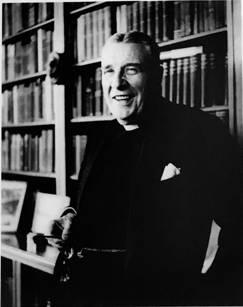
Rev. Dr. Samuel M. Shoemaker, Jr. (1893-1963) – Rector, Calvary Episcopal Church, N.Y.C. (1925-1951). He was the leader of the Oxford Group Movement in the United States (1921-1938). His teachings inspired Bill W. and the early A.A. members.

Non-Alcoholic Friends of AA's Founders Dr Samuel Shoemaker (Oxford Group)