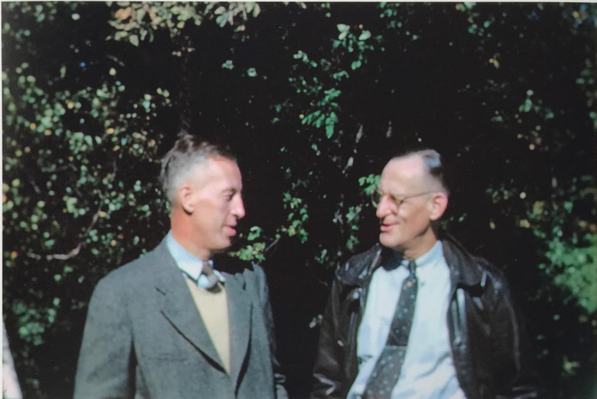
Bill W. and Dr. Bob at Stepping Stones – early 1940s (still image from rare film)