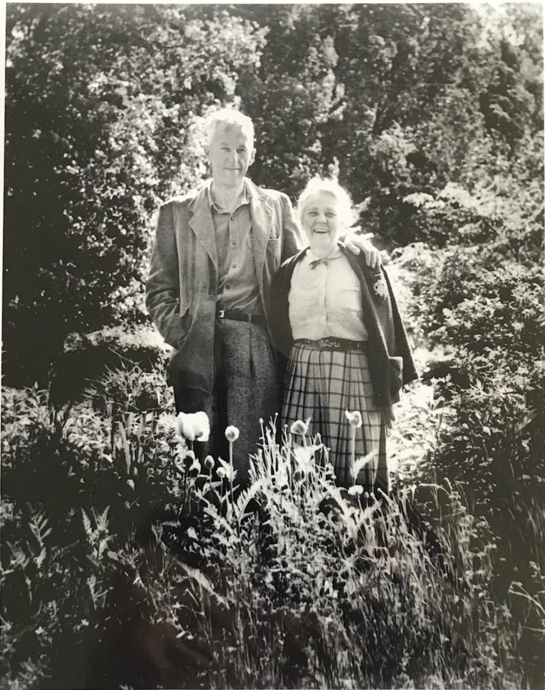
Bill and Lois in garden at Stepping Stones – 1960s

"We are not a glum lot" ... Pass it On! Bill W & Lois - garden at Stepping Stones