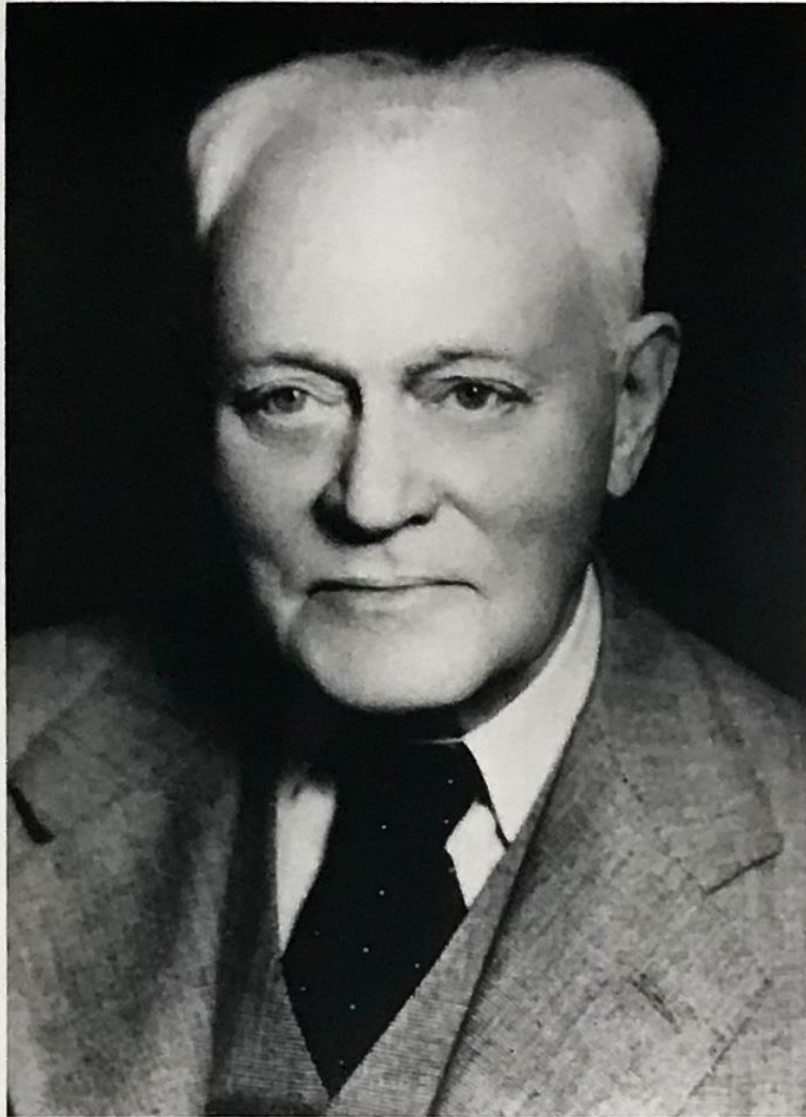
William "Silky" Silkworth, M.D. (1874-1951) – Towns Hospital Physician-In-Chief. Bill W. was his patient. He was one of A.A.'s earliest supporters in the medical profession.