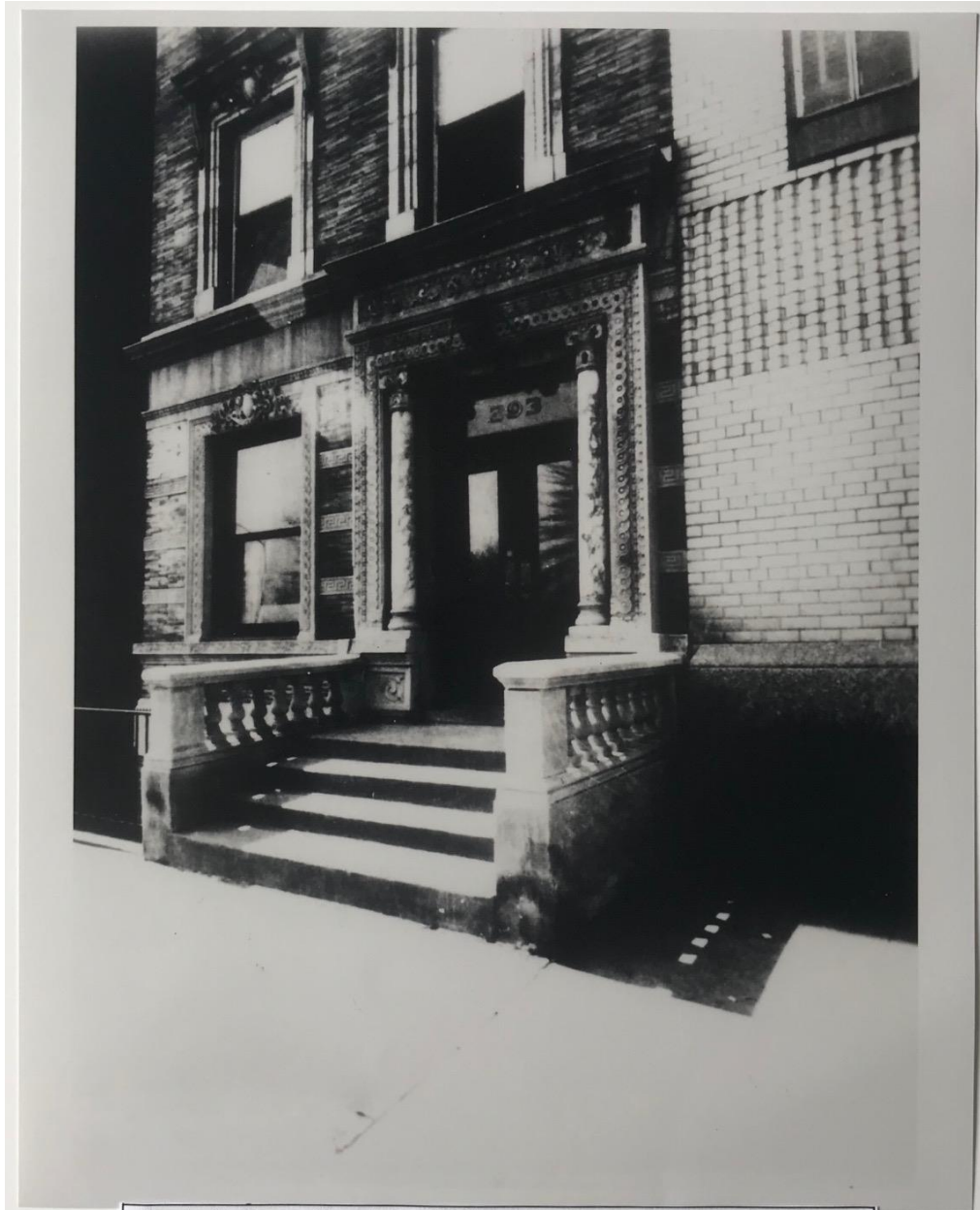
Charles B. Towns Hospital – 293 Central Park West, N.Y.C. Bill W. was a patient here three times, and this was the location of his spiritual experience in December 1934.