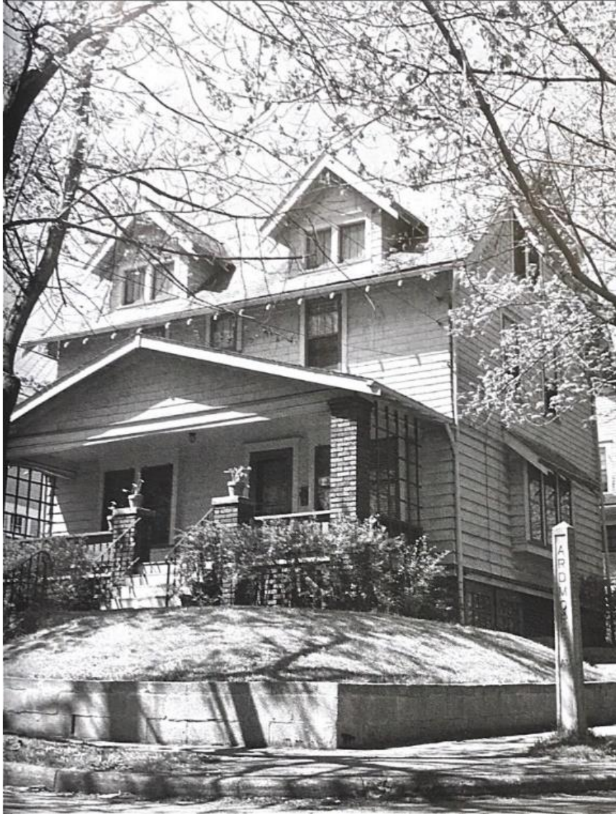
Home of Dr. Bob & Anne